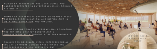
LECTURE HALL, EVENT SPACE ENTRY