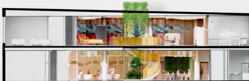
BUILDING SECTION SCALE: 1/16" = 1'-0"