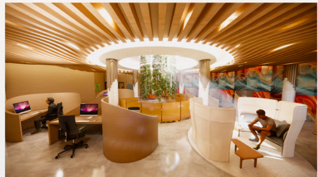
OPEN STUDIO AREA